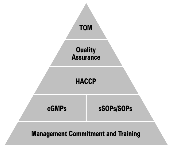
The quality pyramid for food processing plants includes HACCP.

HACCP is only part of a total commitment to food safety and quality that a food processing plant must implement. Current good manufacturing practices (cGMPs) and a set of standard operating procedures (SOPs) are the absolute minimum prerequisites for a food safety program. cGMPs effectively address the food plant environment and operating conditions necessary to produce food in a hygienic manner. These are mandated by regulatory authorities who inspect the processing plant and are codified in 21CFR110. The entire regulation is available at the FDA Web site, www.cfsan.fda.gov/~lrd/cfr110.html .