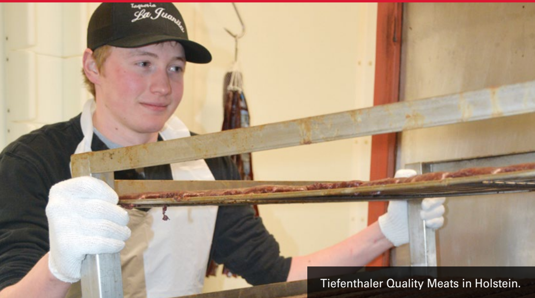
Tiefenthaler Quality Meats in Holstein.