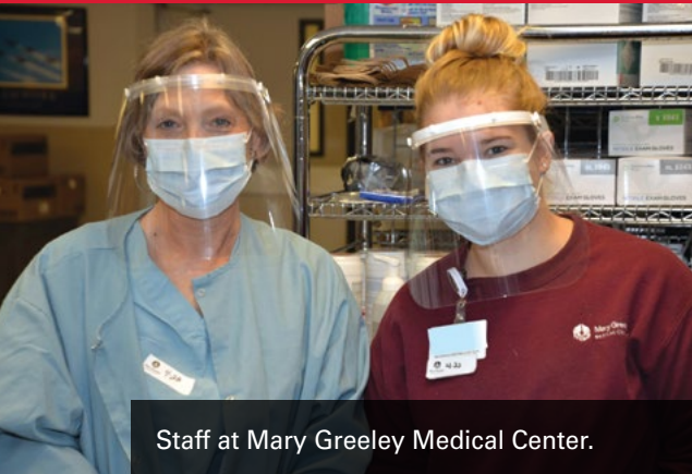
Staff at Mary Greeley Medical Center.