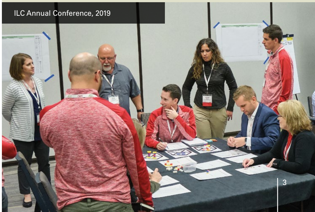
ILC Annual Conference, 2019

➤ For more information, contact Tracy Schuster at tschust@iastate.edu or 515-715-0164.