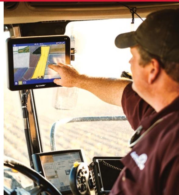
Left and center, production at Ag Leader. At right, technology in use in a tractor.