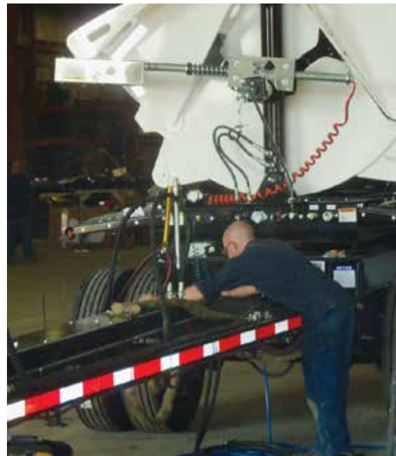
Above: A SmithCo employee welds part of a side-dump trailer. Below: A SmithCo worker applies finishing touches to a pup trailer.